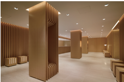
Title : KPMG AZSA LLC Office Location : Chiyoda-ku, Tokyo Usage : Office Total floor area : 461㎡ Completion : 2008

An installation for Toshiba presented at Salone del Mobile in Milano. As the production of incandescent light bulb has declined shifting to LED bulb, we tried to express the universal beauty of the architecture highlighted by light bulbs and the expansion of the cultures transitioned from the past to the future. It received high praise from editors and journalists who visited the site and attracted attention from media all over the world.