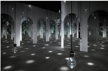
Title : OVERTURE Location : Tortona Milan, Italy Usage : Installation Total floor area : 176㎡ Completion : 2009

A six-story complex building in Tokyo. It is an open space that can fully capture the outdoor view in a high-density city. The top floor is a penthouse, the middle class is an office. There is a store on the first floor, opening to the city, contributing to the local community.