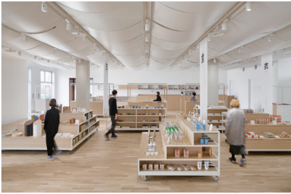
Title : FUKUI MAKERS CAMPUS Location : Sabae-shi, Fukui Usage : Multi hall, Work room, Design lab, Cafe Total floor area : 2,010㎡ Structure : RC Completion : 2016

Public facilities in Fukui prefecture. We renovated the conference building and turned it into “Makers Campus” that can be used by designers and manufacturers. In the Campus, there are design centers, design laboratories, cafes and so on. Large portable furniture is dotted and can be used in various applications depending on the combination. Workshops, exhibitions and lectures were held, and it is the base to support manufacturing in Fukui.