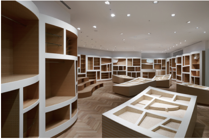
Title : Tokyo's Tokyo Location : Shibuya-ku, Tokyo Usage : Shop Total floor area : 171㎡ Completion : 2012

A shop for manga and animation. Inside the store surrounded by furniture using cartoon technique, browse merchandise of books in the order that a cartoon moves on, and walk the store as the story goes on. The internet has become widespread, and the value of experienced stores has been questioned. It shows a new personality as a store. It received high praise at the design award.