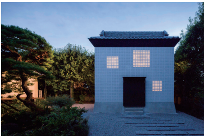
Title : Rebirth House Location : Moriya-shi, Ibaraki Usage : Assembly salon Total floor area : 41㎡ Structure : RC Completion : 2014

Housing for a family of three in Kanagawa prefecture. There is a kitchen room with high ceiling, and family rooms are connected by opening. Presence of the family is felt anywhere, and private areas can also be secured. As an example showing new possibilities of small housing, many case studies are introduced in media