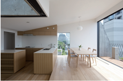
Title : GRASS BLDG. Location : Minato-ku, Tokyo Usage : Complex Facility Total floor area : 305㎡ Structure : RC Completion : 2010

A shop for manga and animation. Inside the store surrounded by furniture using cartoon technique, browse merchandise of books in the order that a cartoon moves on, and walk the store as the story goes on. The internet has become widespread, and the value of experienced stores has been questioned. It shows a new personality as a store. It received high praise at the design award.