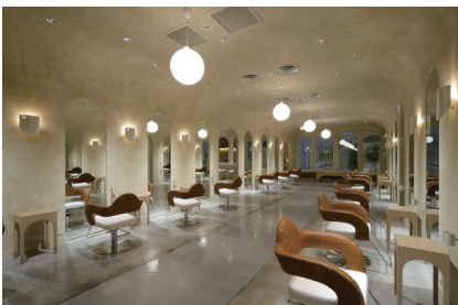
Title : Hair Salon Tierra Location : Shibuya-ku, Tokyo Usage : Salon Total floor area : 182㎡ Completion : 2008

Office for KPMG AZSA & Co. Taking advantage of traditional technology, we aimed at an office with the atmosphere filled with Japanese culture and climate. A delicate yet powerful space seen in the Japanese traditional style "Sukiya" has been realized. It shows the direction of office design by universal beauty.