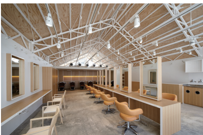
Title : Hair Do Location : Chiba-shi, Chiba Usage : Salon Total floor area : 220m 2 Structure : Steel frame Completion : 2013

A restaurant in the departure lobby of Haneda Airport Terminal 1. It is a flagship shop of Tokyo Airport Restaurant which manages direct-operated eateries at Haneda airport. Three restaurants are connected under one eave and lined up like a townhouse. It also received high evaluation at the design award, it is taken up as an example of the interior by Tokyo Design Center which will disseminated to the world.