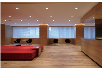
Title : Rakuten Tower Location : Shinagawa-ku, Japan Usage : Office Total floor area : 6,500m 2 Completion : 2007

Beauty salon in Shibuya, Tokyo. The mirrors that are essential to the beauty salon are made as the window in architecture. The mirror stands have been put away, and the continuous arched opening is expanded to make a beautiful space. An experimental interior design has won First Prize at the German Interior Award.