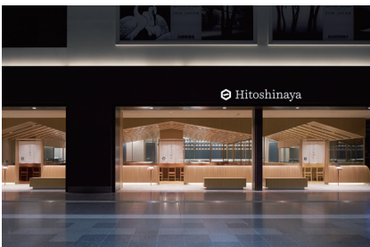
Title : Hitoshinaya in Haneda Airport T1 Location : Ota-ku, Tokyo Usage : Restaurant Total floor area : 235m 2 Completion : 2014

We dismantled the 120 years old storehouse that was in danger of collapse by the Great East Japan Earthquake and reconstructed it as a salon for the purpose of interaction between local residents. The wall surface which is built of bricks with small holes looks like a white wall during the day, and when the night comes, the light inside overflows which makes the window appears in the dark. It reproduces the landscape with a traditional store house. It received high praise at the AR House Awards in UK, one of the most influential housing construction awards, gaining the media's attention all over the world.