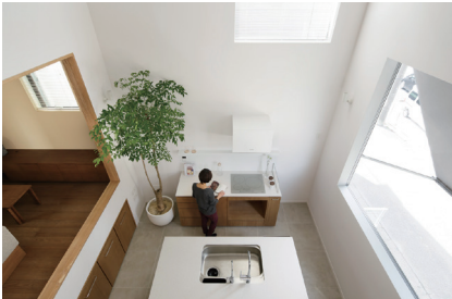
Title : Blink House Location : Kawasaki-shi, Kanagawa Usage : House Total floor area : 91m 2 Structure : Wood Completion : 2015

Public facilities in Fukui prefecture. We renovated the conference building and turned it into “Makers Campus” that can be used by designers and manufacturers. In the Campus, there are design centers, design laboratories, cafes and so on. Large portable furniture is dotted and can be used in various applications depending on the combination. Workshops, exhibitions and lectures were held, and it is the base to support manufacturing in Fukui.